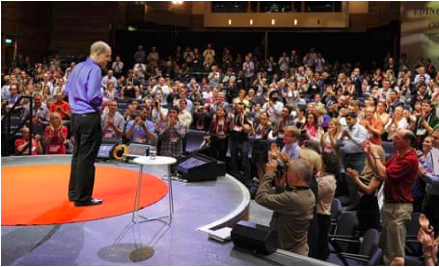
▲ Alain de Botton speaks during during TEDGlobal 2011, in Edinburgh.

In our culture, talking about the future is sometimes a polite way of saying things about the present that would otherwise be rude or risky.